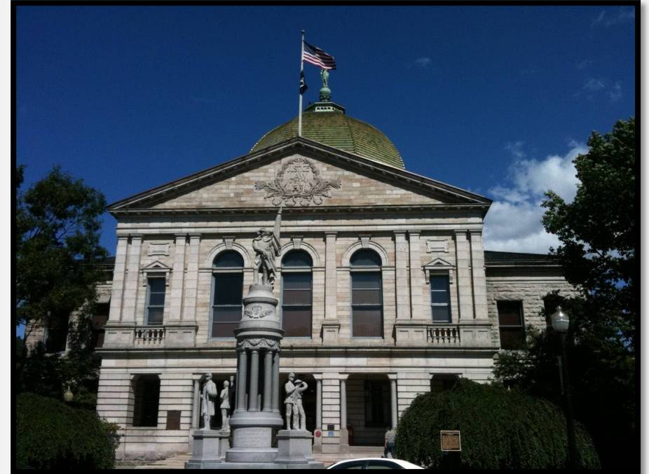
Bradford County Courthouse FY 1995