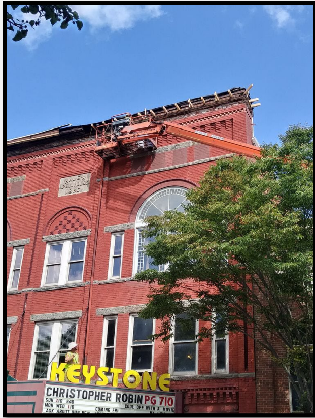
Keystone Theatre Bradford County Regional Arts Council Towanda, Bradford County FY 1994, 2005, 2016