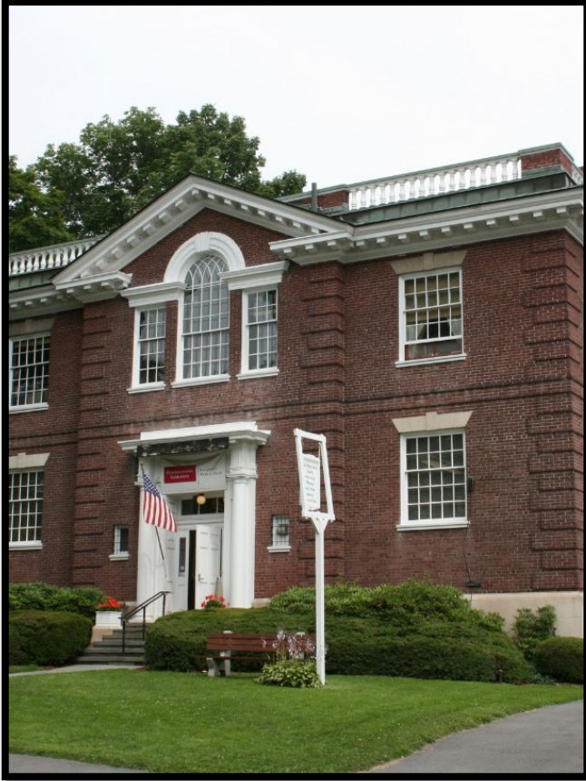
Susquehanna County Historical Society Montrose, Susquehanna County FY 2008