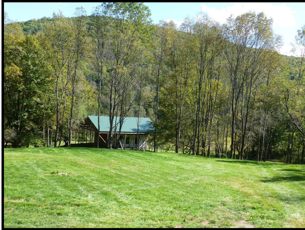
Dennis Farm Dennis Farm Charitable Trust Brooklyn Twp, Susquehanna County FY 2014