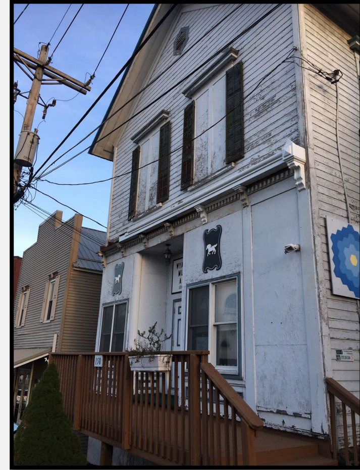
Lodge Annex Wyalusing Valley Museum Wyalusing, Bradford County FY 2016