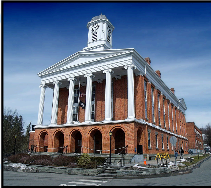
Susquehanna County Courthouse FY 1996

Planning Project Category Grant Awards $5,000 to $25,000