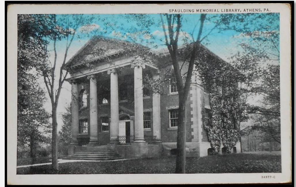
Spaulding Memorial Library Tioga Point Museum Athens, Bradford County FY 1997, 2005